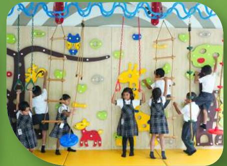
Wibbly Wobbly Climbing Wall