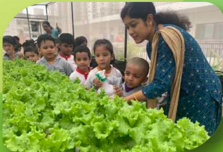
Hands-on Learning and Sensory-based experience