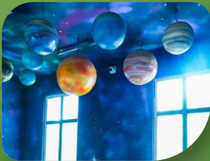
Solar System 3D Model

We have carefully curated these spaces to ensure they are both safe and stimulating, offering our children opportunities to challenge themselves while having fun and ensuring that each child thrives in a nurturing, innovative atmosphere.