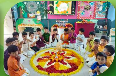
Value-based education and celebration of various festivals