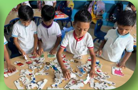
Education through exploration, discovery and experimentation