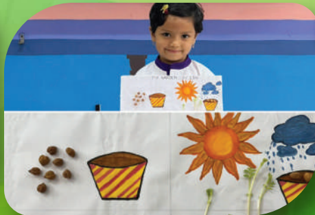
Learning through structured and unstructured activities