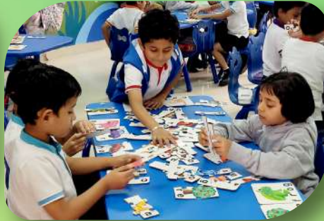
Learner - Centred - Teaching Style