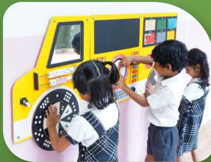
Bingo - The Big School Bus