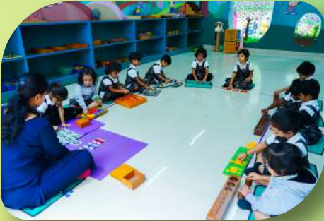
An Amalgamation of the Montessori and the play-way method